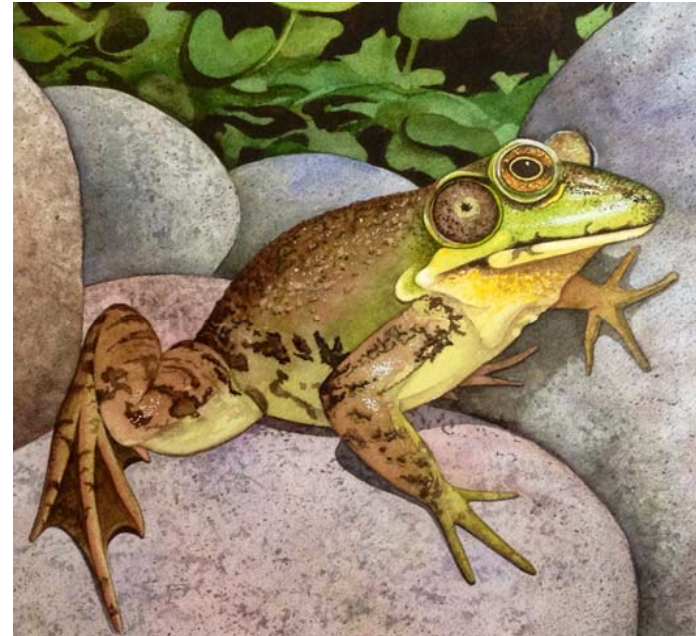
"Little Green Prince"